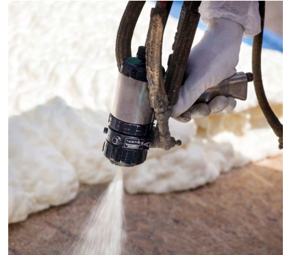
Spray foam insulation application