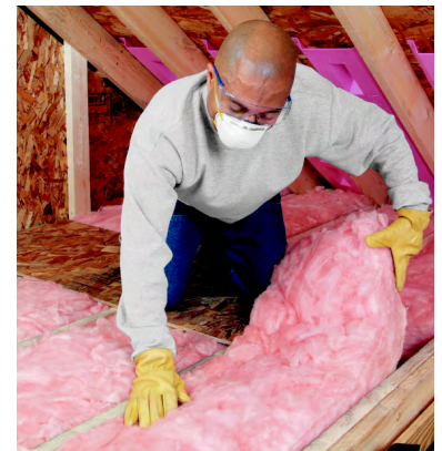
Batt insulation installation

Insulation is a classification of materials that are used to reduce heat transfer from the inside and outside of a building. Most commonly, insulation is used in attics, ceilings, walls, floors and crawl spaces to help maintain more constant, comfortable temperatures in your home.